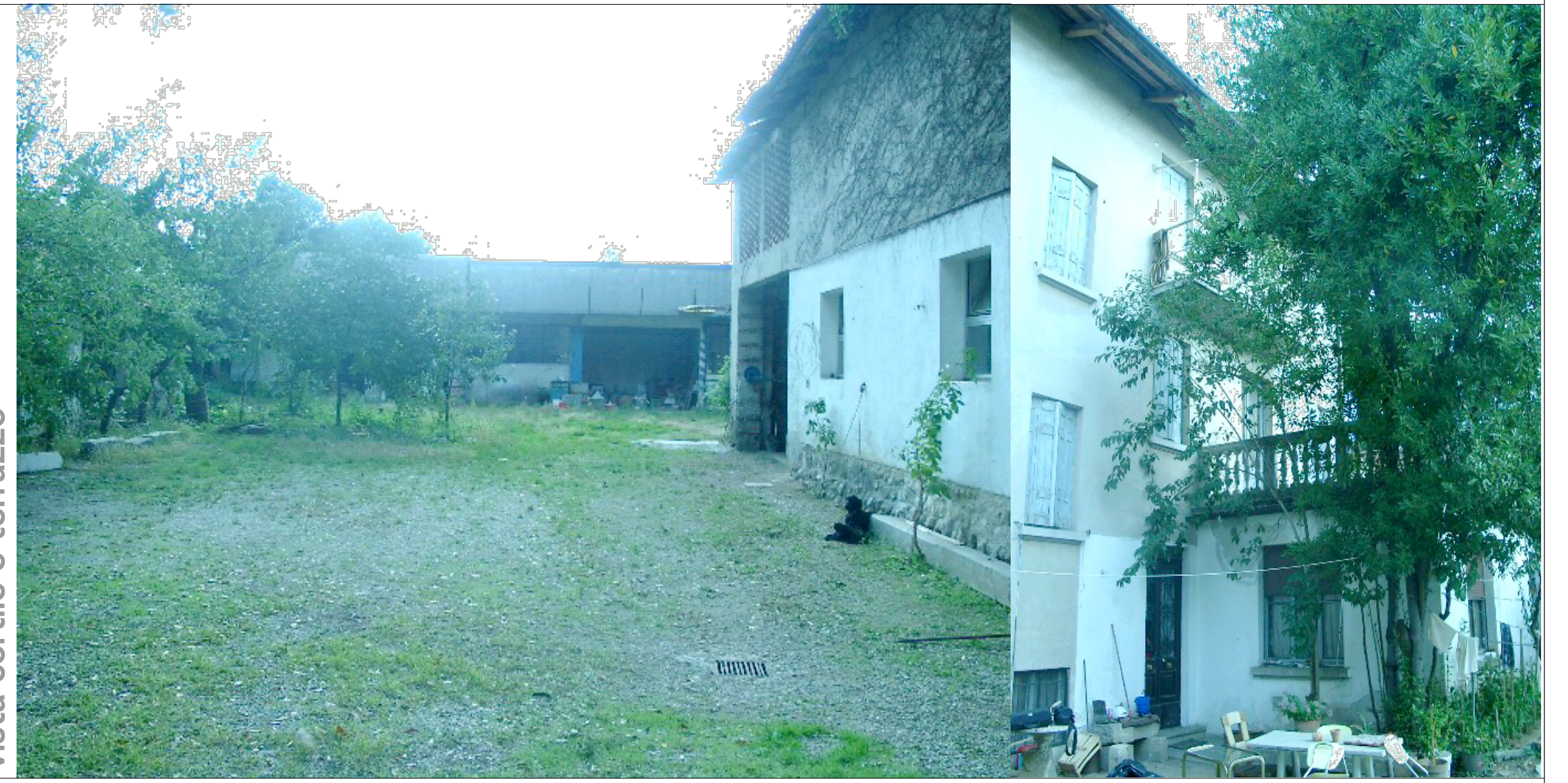
vista cortile e terrazzo