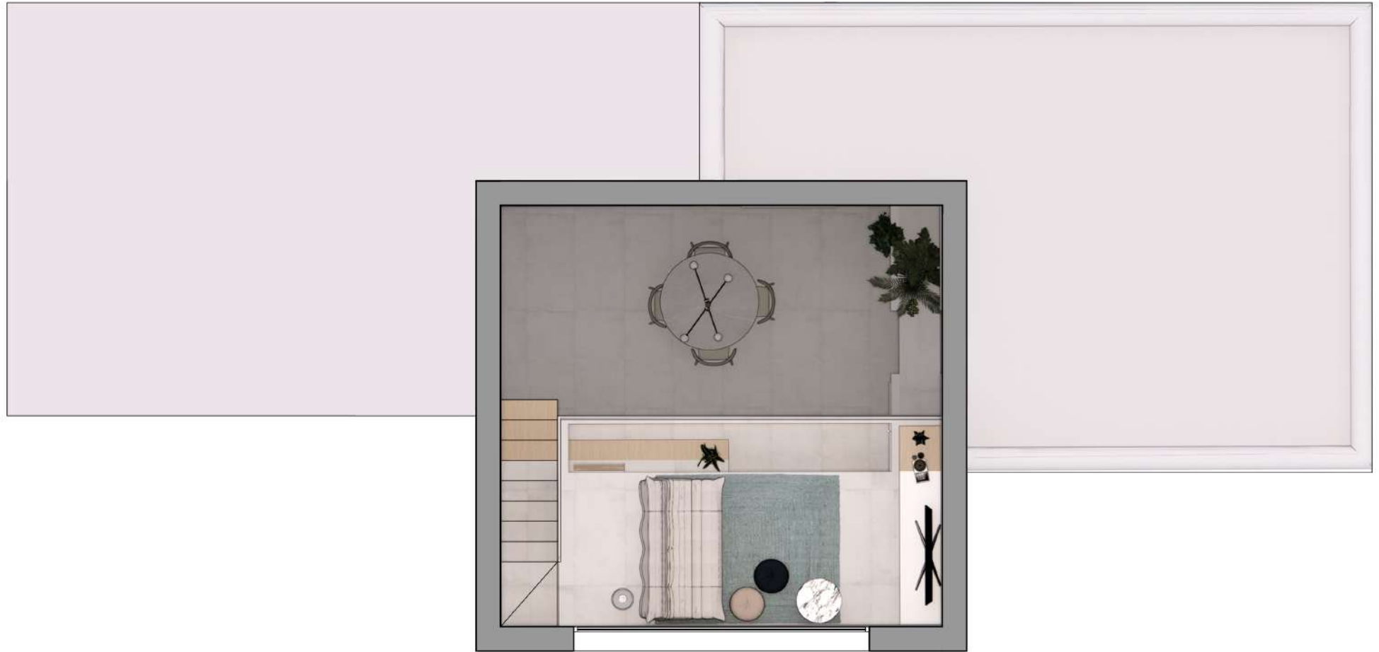
VILLA A Soppalco