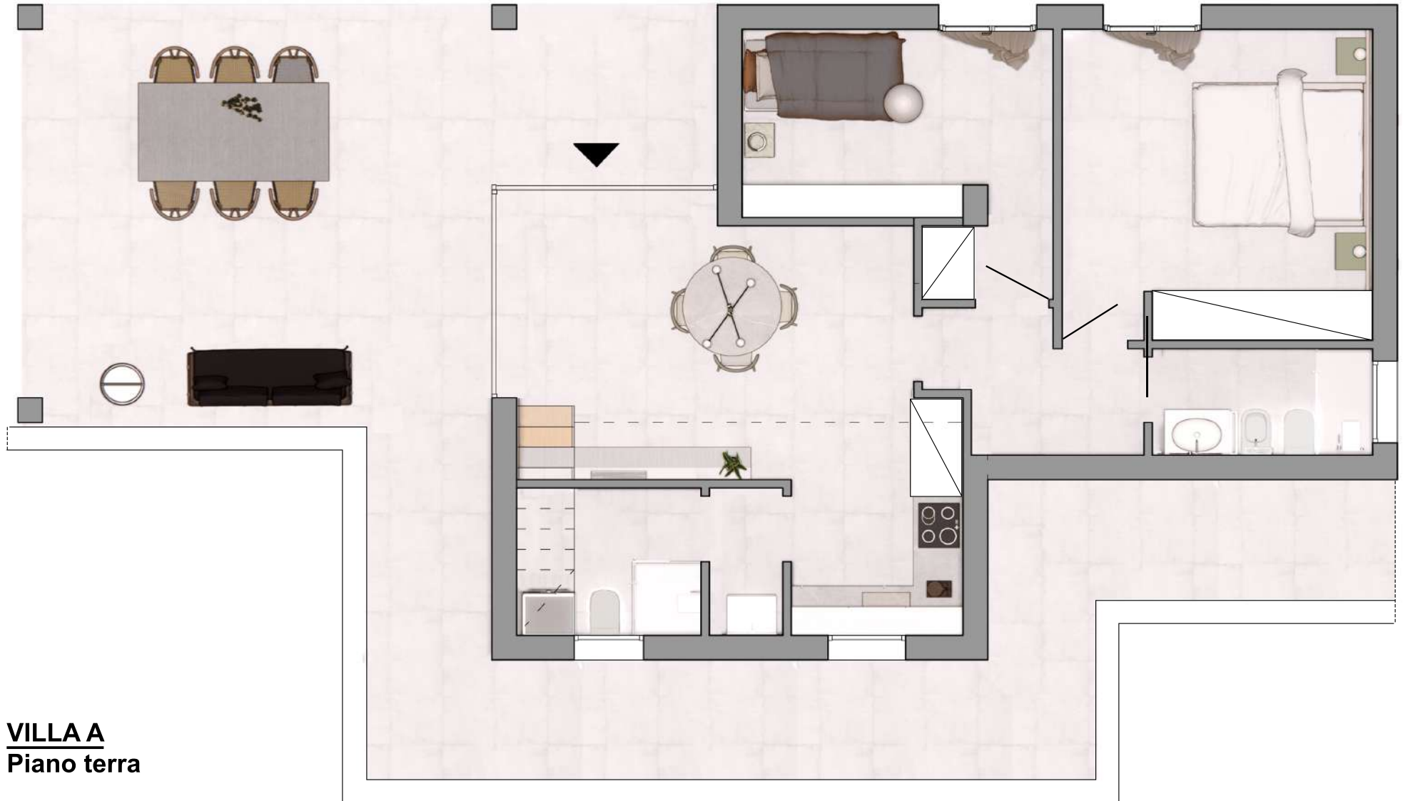
VILLA A Piano terra