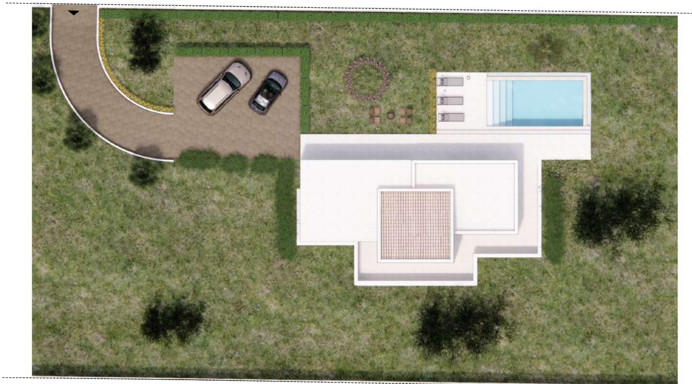
VILLA A Planimetria generale