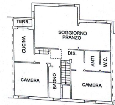
PIANO PRIMO H.=2.78ml.