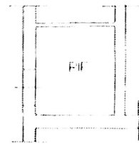
PIANO TERRA H 260