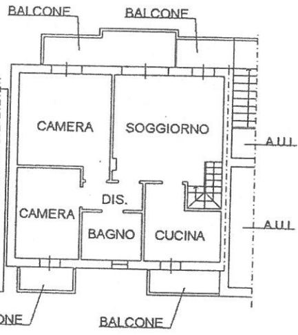
PIANO PRIMO H=2.70m