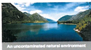
An uncontaminated natural environment

Lake Idro is situated between Lake Garda and Lake Iseo in the alpine foothills near Brescia with its hotels, campsites and villages, offering a totally relaxing holiday experience.