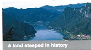
A land steeped in history

Lake Idro is situated between Lake Garda and Lake Iseo in the alpine foothills near Brescia with its hotels, campsites and villages, offering a totally relaxing holiday experience.