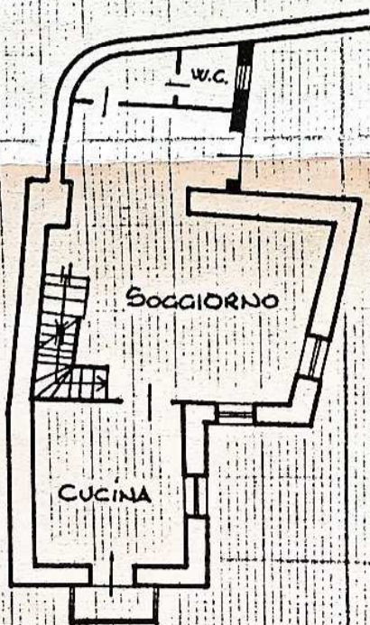
PIANO TERRENO H = 2.68 m