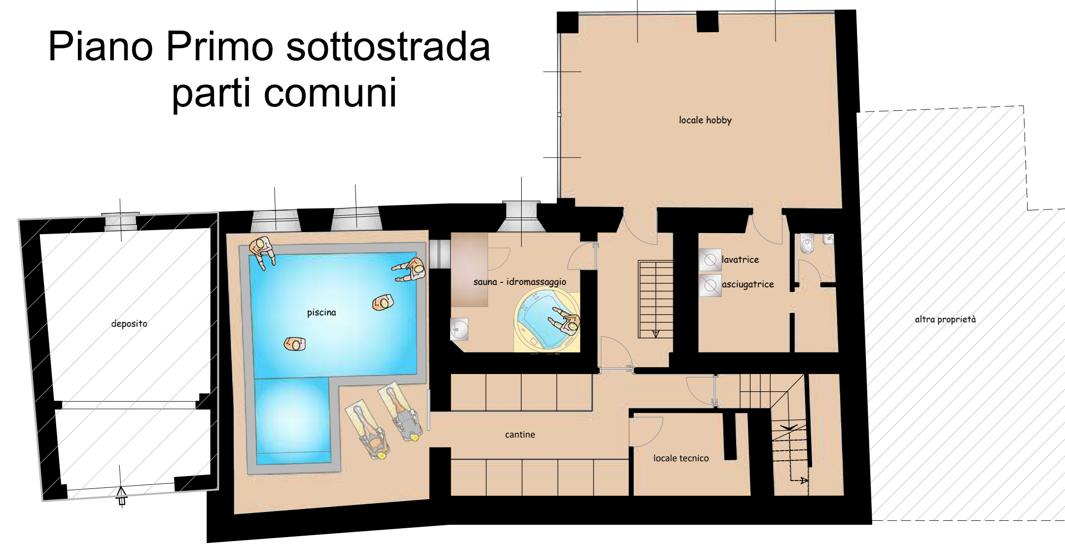
Piano Primo sottostrada parti comuni