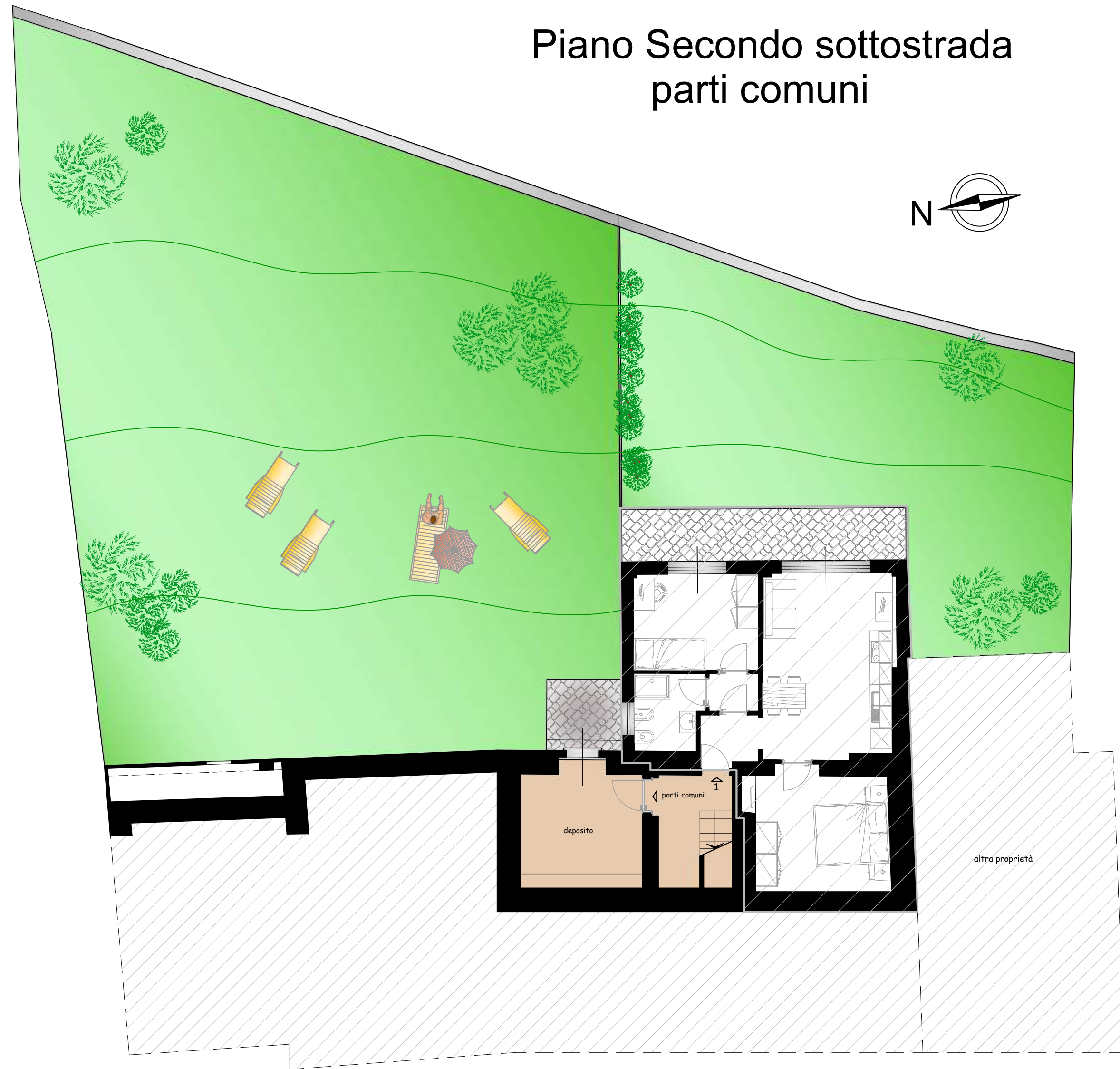
Piano Secondo sottostrada parti comuni