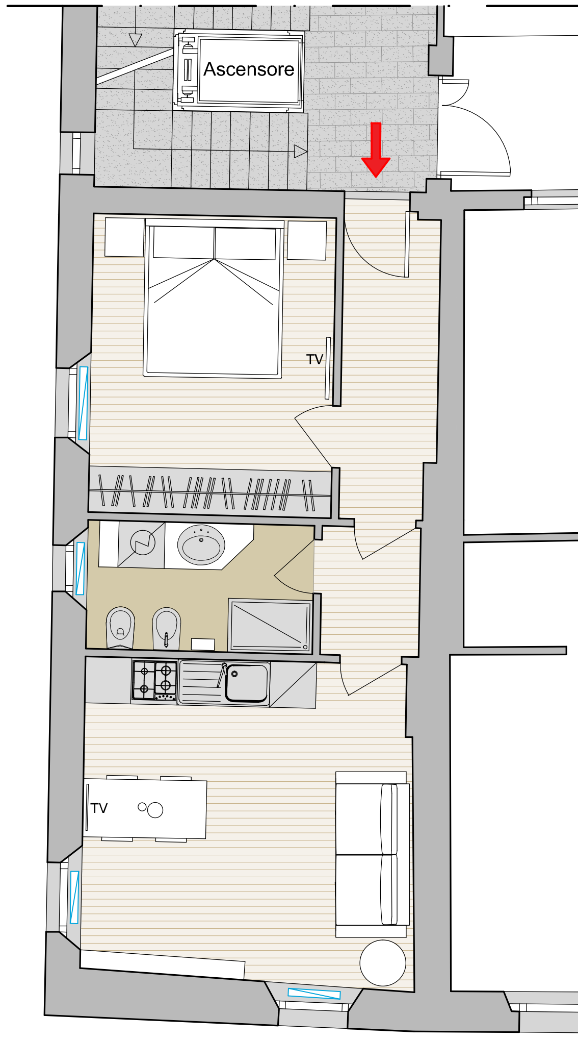
UNITA' IMMOBILIARE 2 - BILOCALE