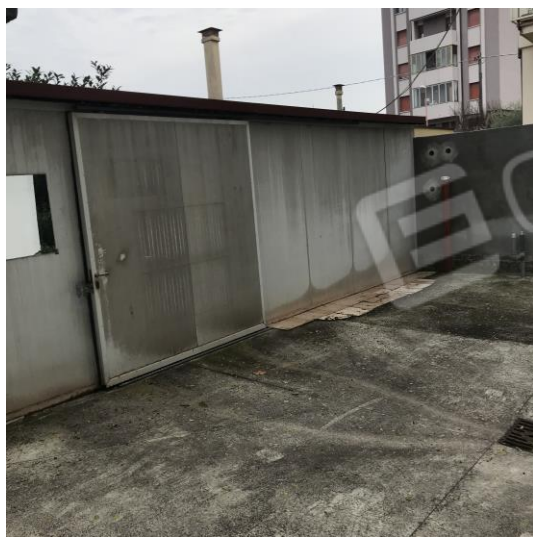
DEPOSITO –Sub. 14-