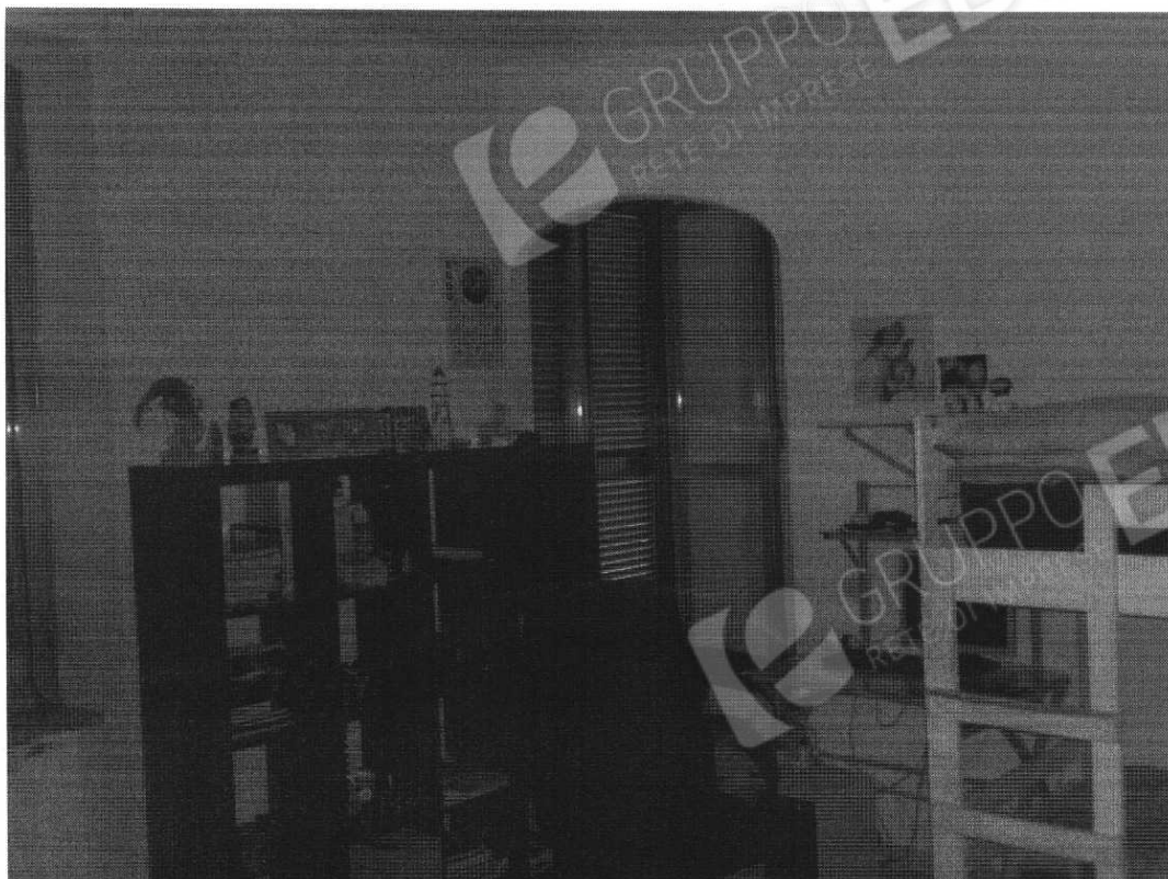
Cameretta Sub.n. 5 Fg.n. 27 Part.n. 350