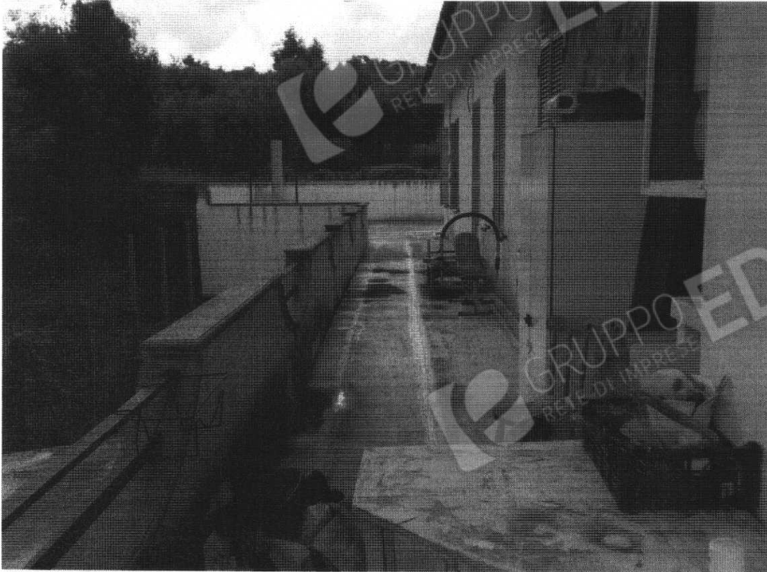
Cucina/Sogg.no. Sub.n. 5 Fg.n. 27 Part.n. 350