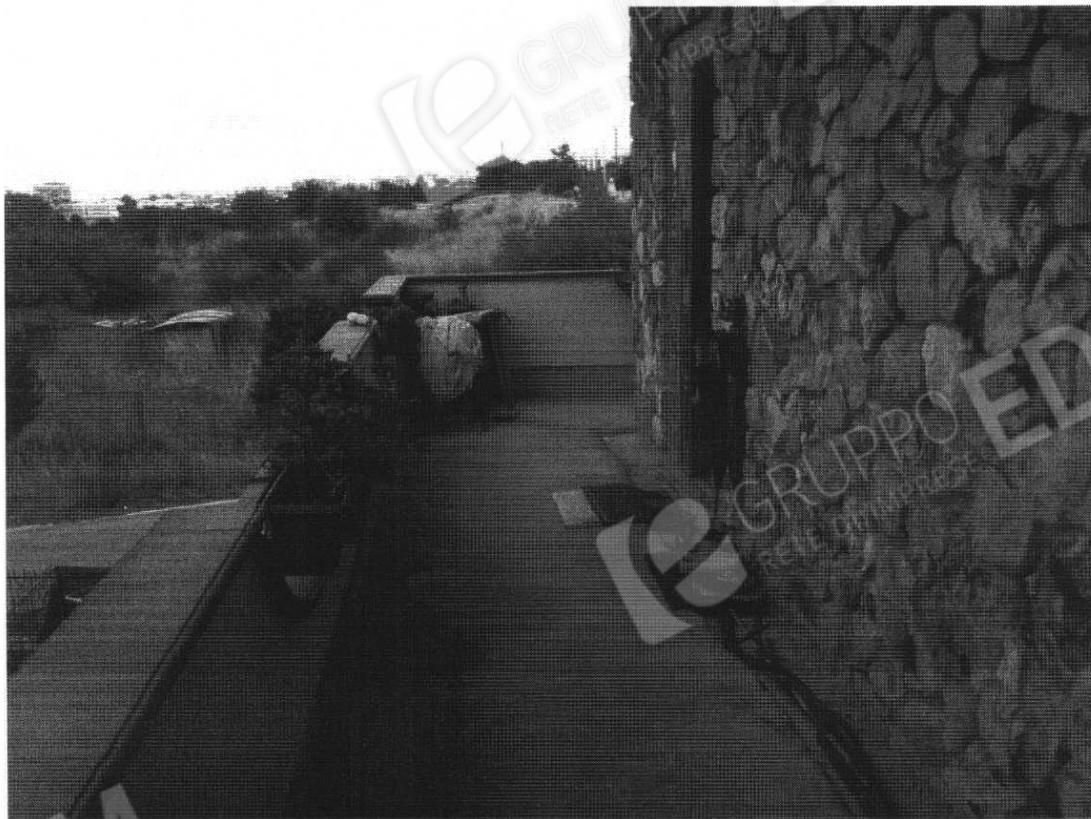
Zona balcone Sub.n. 5 Fg.n. 27 Part.n. 350